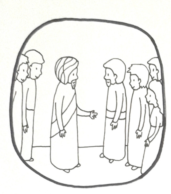
1 Jesus said to the crowds: "To what shall we compare the kingdom of God?