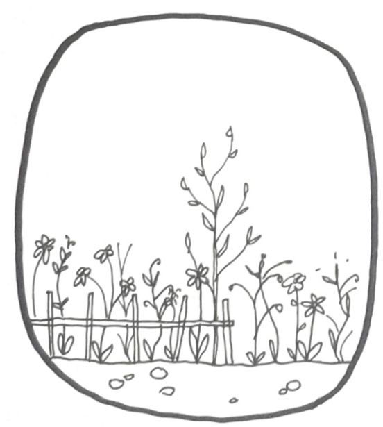
3 But once it is sown, it springs up and becomes the largest of plants