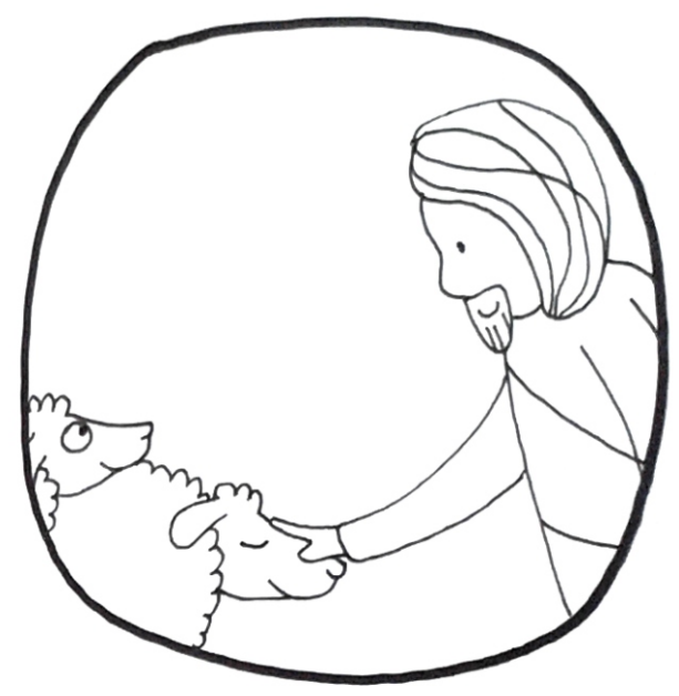
2 I know mine and mine know me, just as the Father knows me and I know the Father; and I will lay down my life for the sheep.