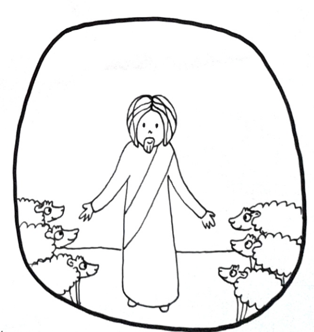
4 This is why the Father loves me, because I lay down my life in order to take it up again. No one takes it from me, but I lay it down on my own."