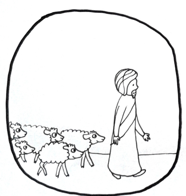
3 I have other sheep that do not belong to this fold. These also I must lead, and they will hear my voice, and there will be one flock, one shepherd.